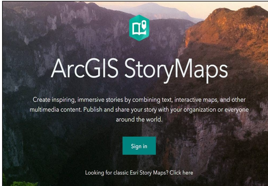
Online Public Education