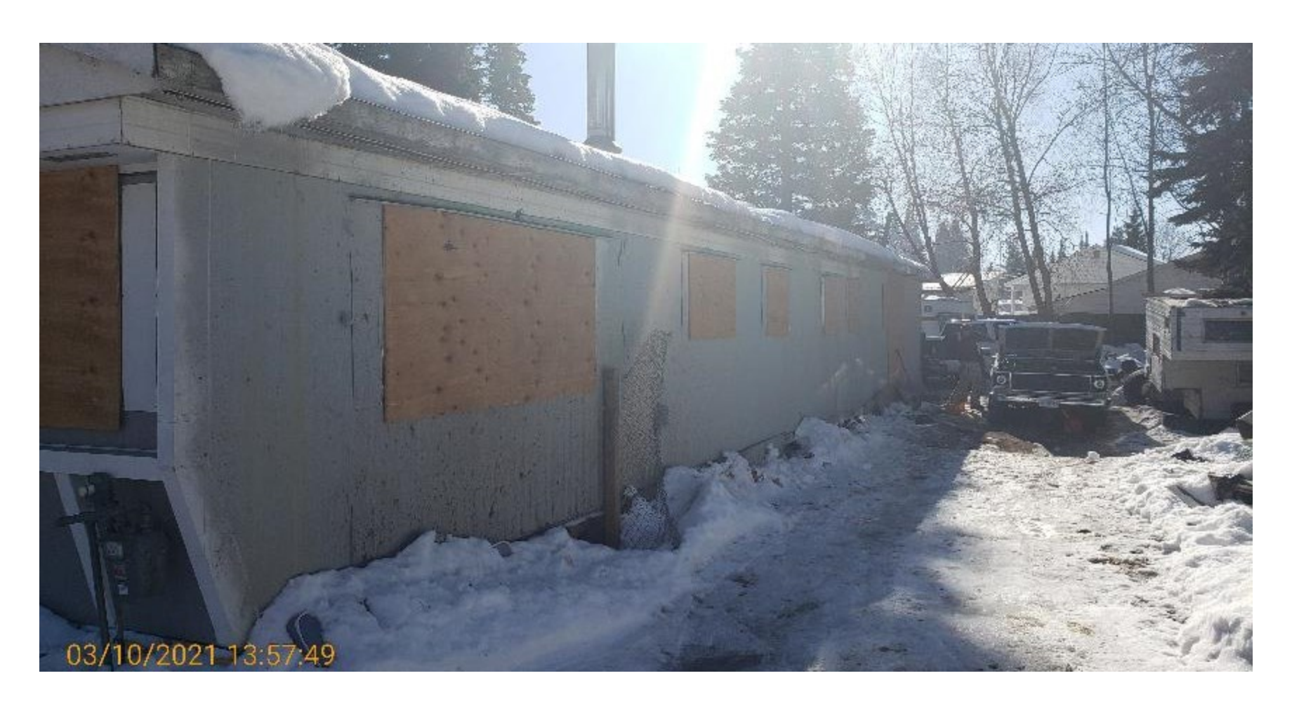
March 10, 2021