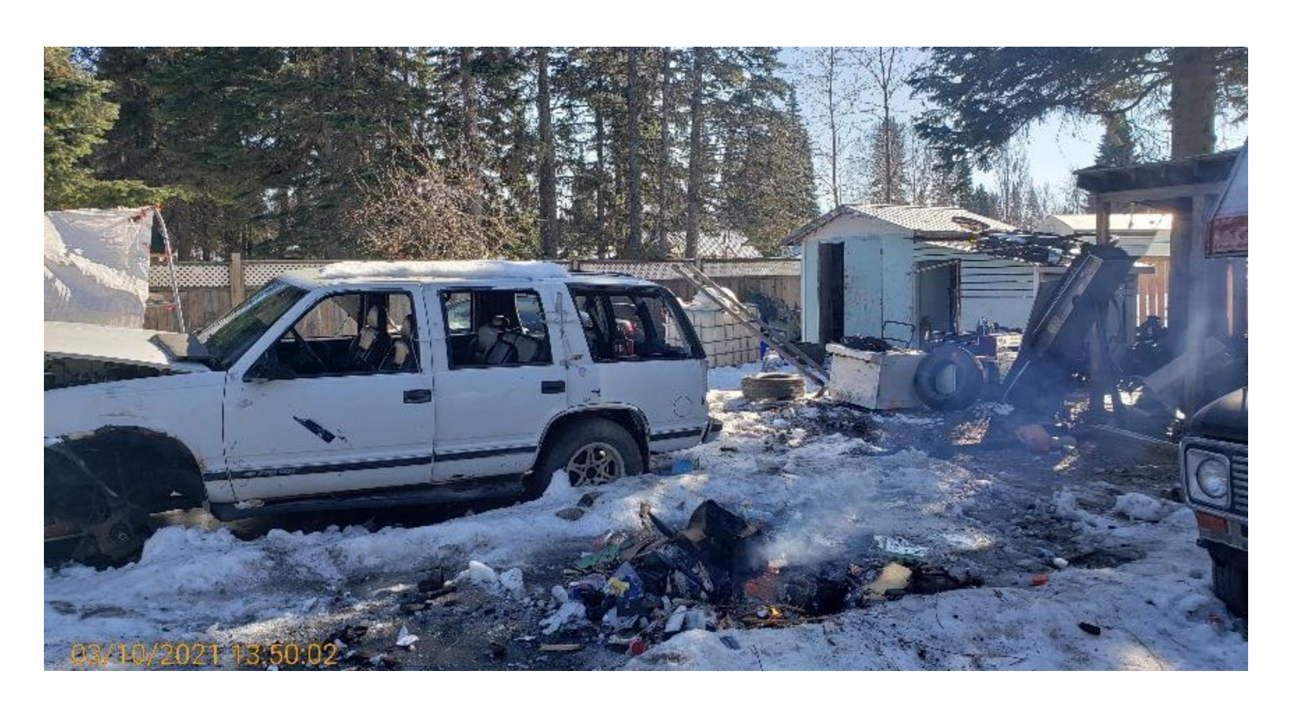
March 10, 2021