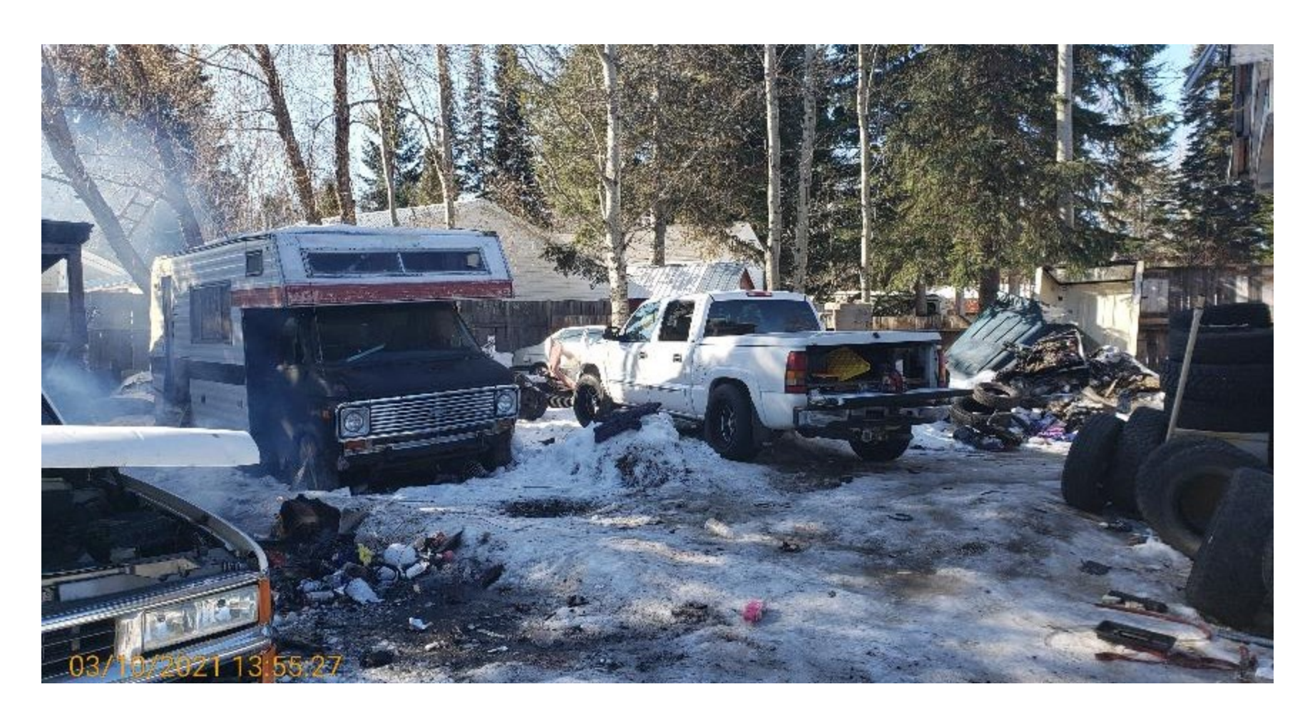
March 10, 2021