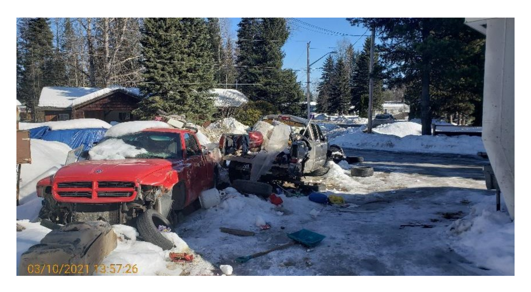
March 10, 2021