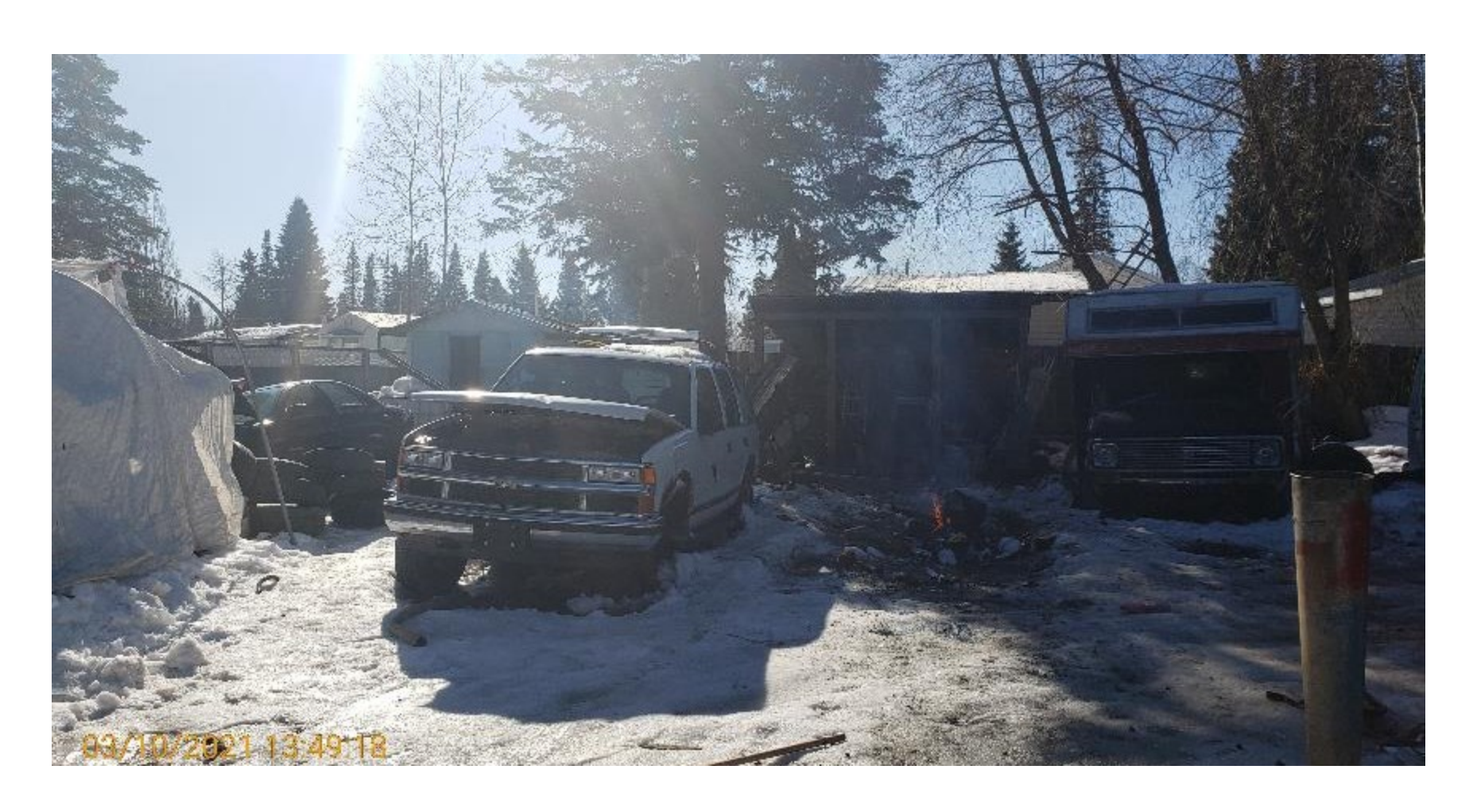
March 10, 2021