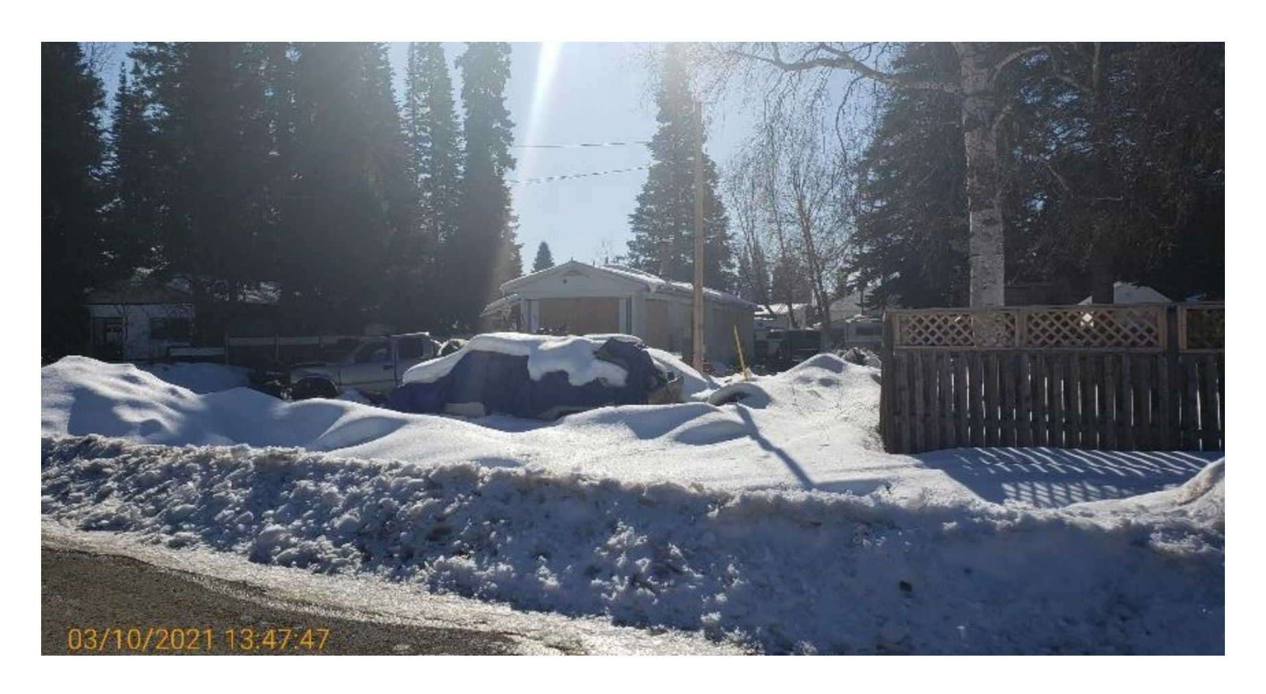
March 10, 2021