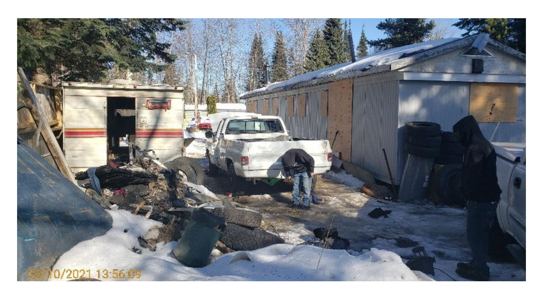
March 10, 2021