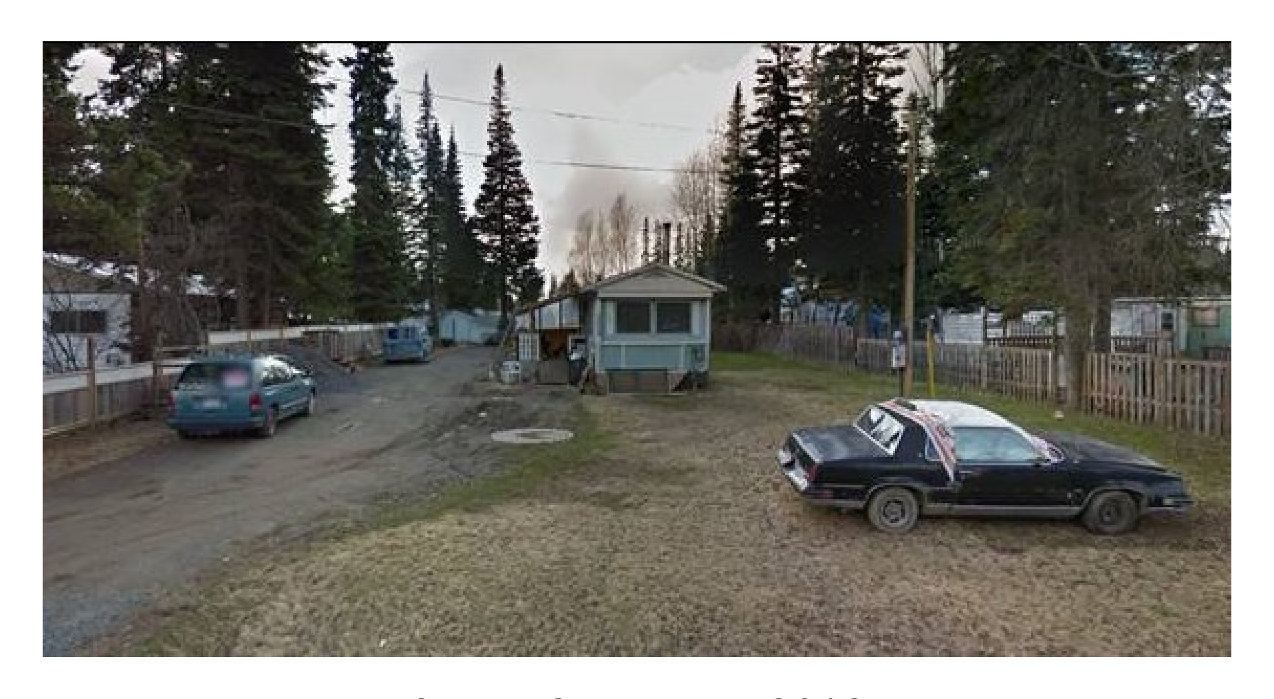
Google Street View 2012