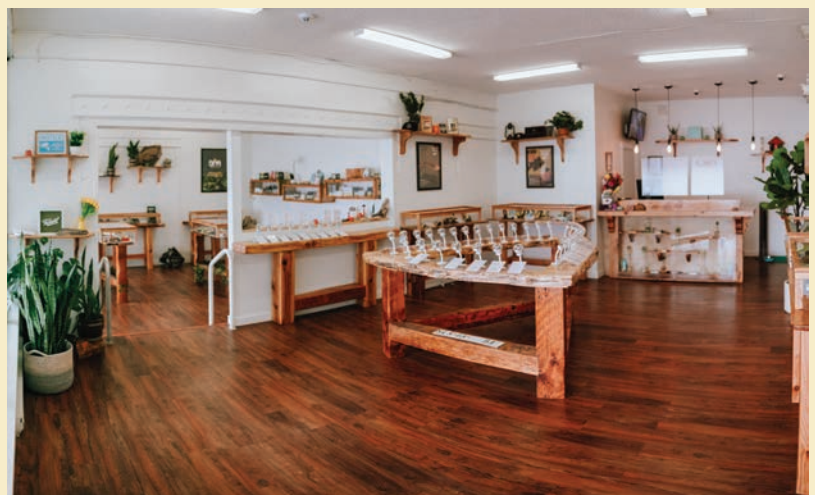
Seaside Cannabis - inside store

Lawful sales Community Safety Healthy Consumption