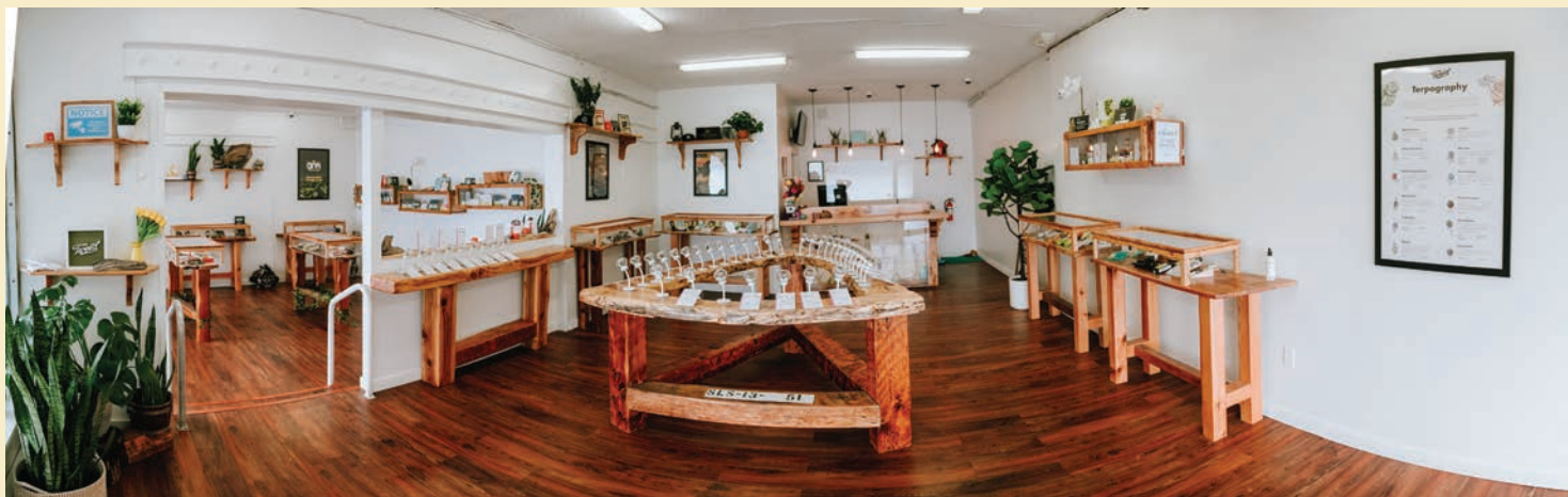
Seaside Cannabis, Brentwood Bay

CANNA NORTHWEST Enterprises Inc. was founded in 2018 in response to the legalization of cannabis in our Country, Province, and Municipality. Prior to cannabis legalization, we had no experience in the cannabis industry and never performed any retail cannabis dealings from any location, physical or virtual. Post legalization, CANNA NORTHWEST successfully operates two non-medical retail cannabis stores with firm adherence to all compliance requirements.