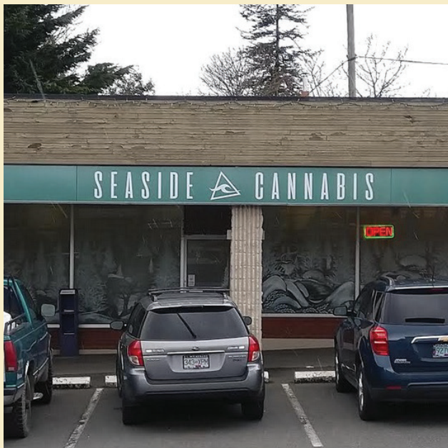
Seaside Cannabis, Brentwood Bay, BC