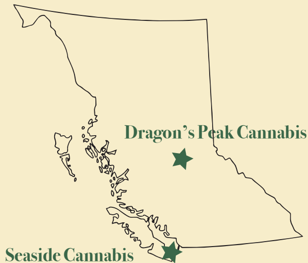
CANNA NORTHWEST Retail Locations

We want our communities to be safe places for our residents and our visitors while providing a convenient and well-considered shopping experience for our customers.