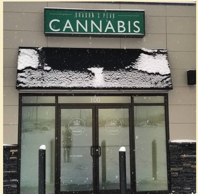
Dragon's Peak Cannabis, Quesnel, BC

To bring safe economic opportunity to our communities by running a responsible and lawful retail cannabis business.