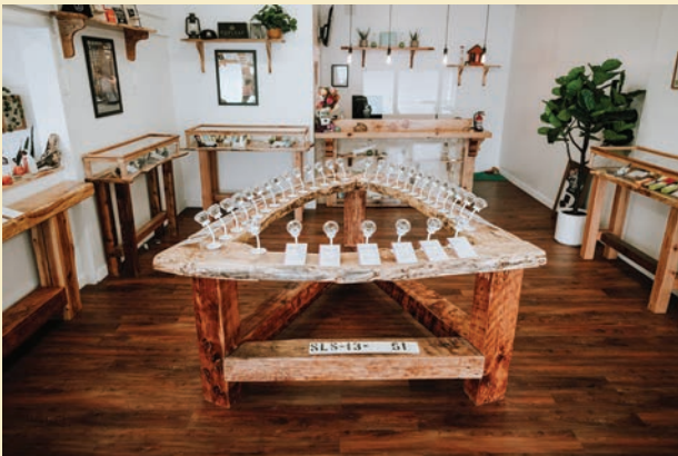
Seaside Cannabis, Brentwood Bay

At CANNA NORTHWEST we provide a unique, more personal shopping experience by having our retail spaces reflect local geography. For instance, our Quesnel store is named for and reflects the local mountains, while our Brentwood Bay store is named for a reflects Vancouver Island's coast.