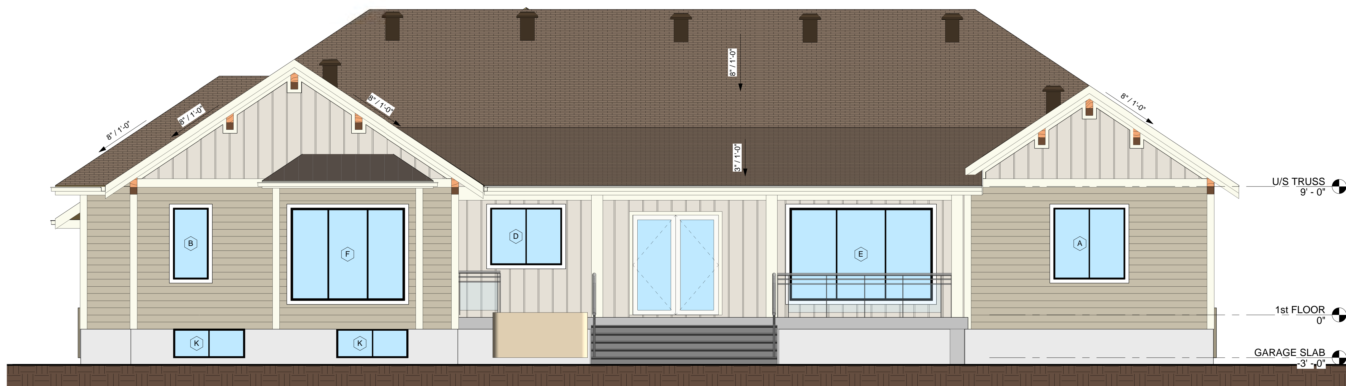
ELEVATION - EAST ELEVATION (REAR)