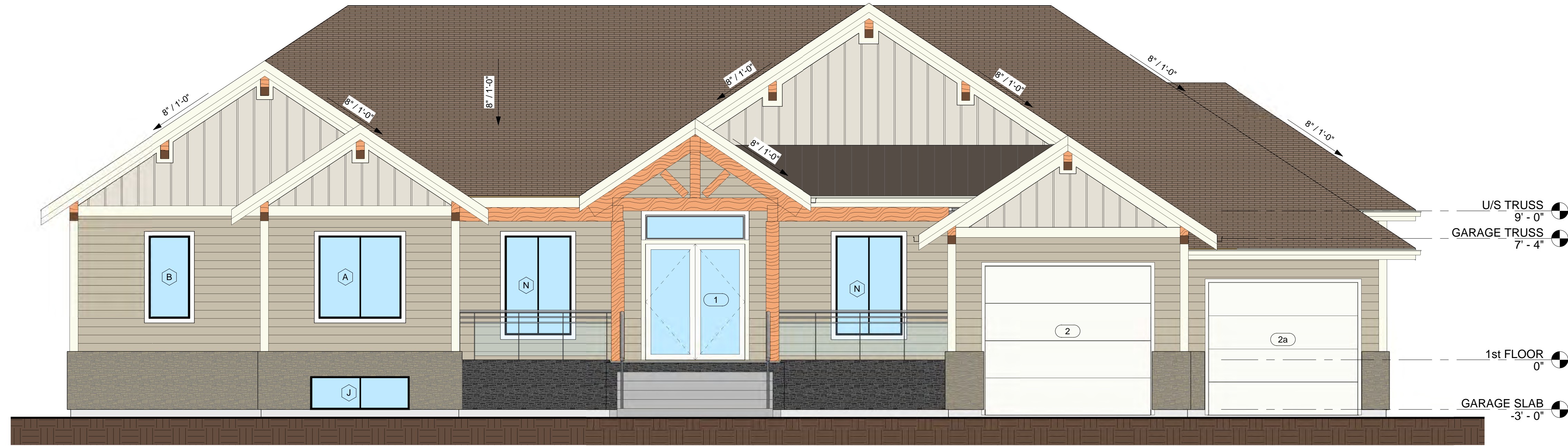
ELEVATION - WEST ELEVATION (FRONT)