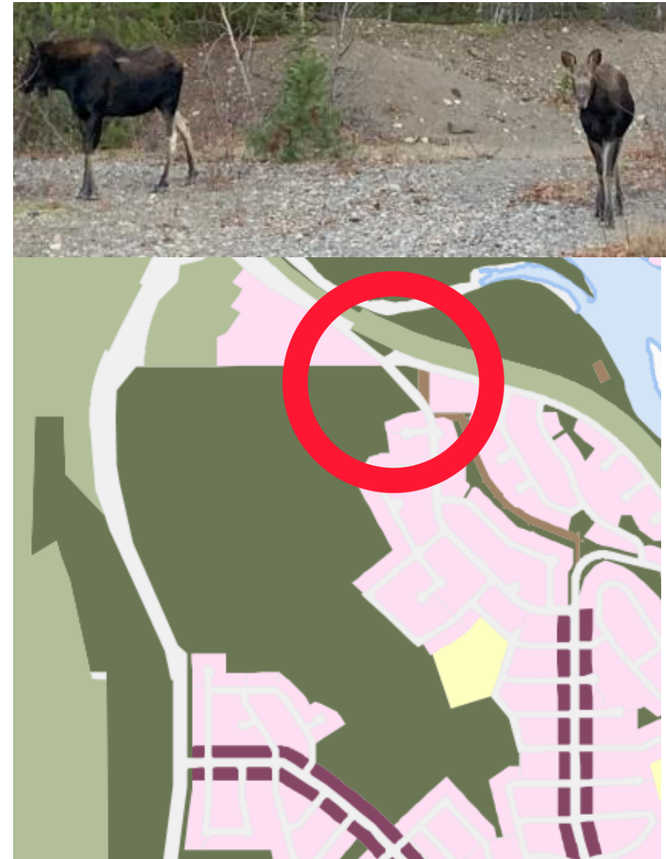
Schedule 12. Future Land Use Map, draft OCP, 2025