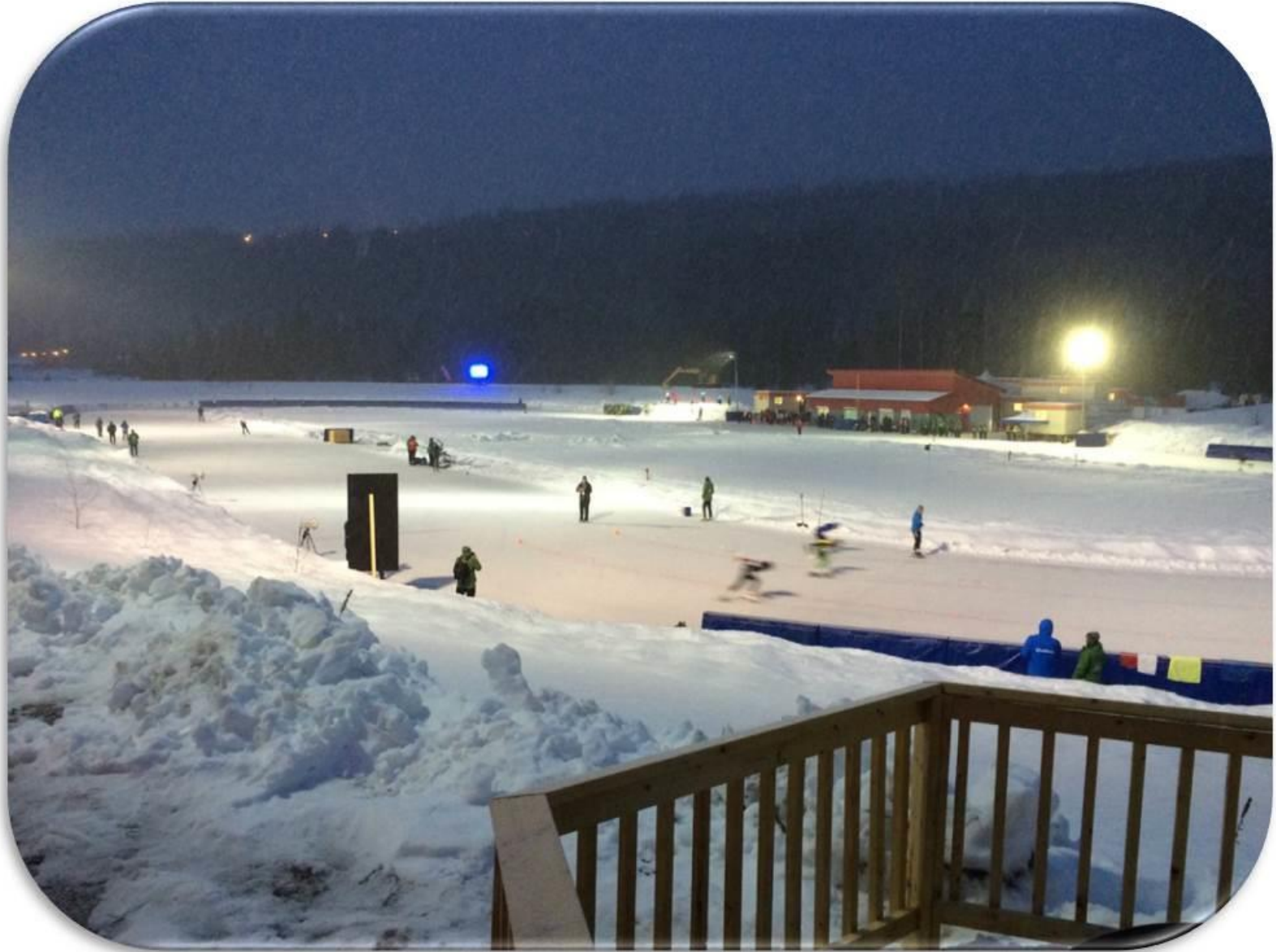
Canada Winter Games 2015