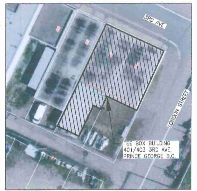
KEY PLAN SCALE: NTS

TEE BOX GOLF SIMULATORS & LOUNGE 401/403 3RD AVENUE, Prince George