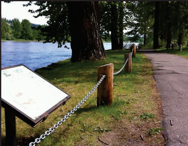
Cottonwood Island and river landscape