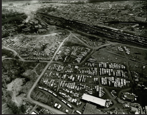
River Road historic sawmill sites