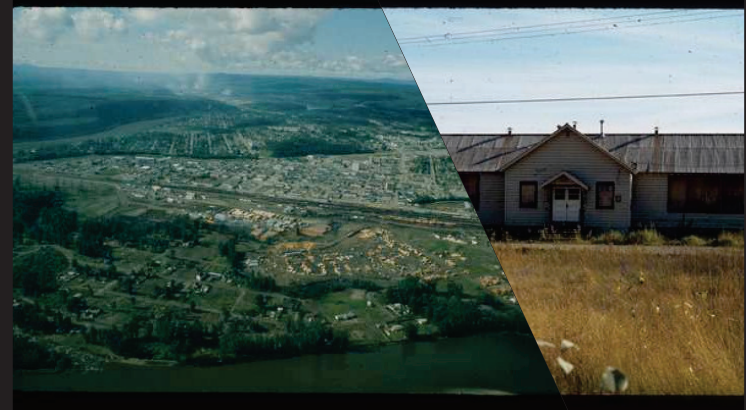
Foley's / Island Cache