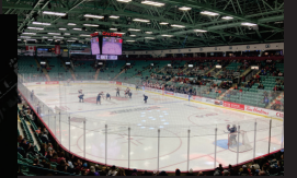
Exhibition Park Complex