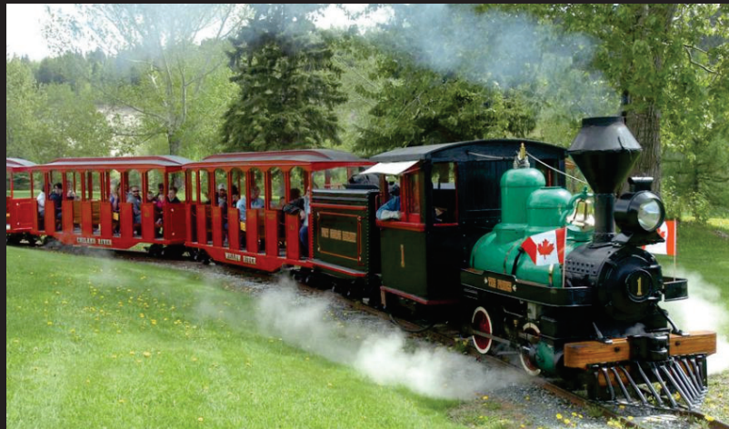
Little Prince Steam Engine and narrow gauge railway