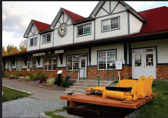
Central BC Railway and Forestry Museum