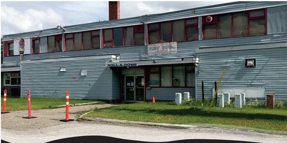
Roll a Dome (Prince George Dome)