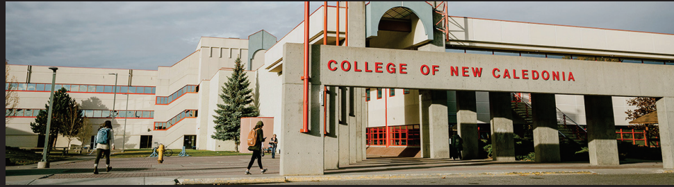
College of New Caledonia