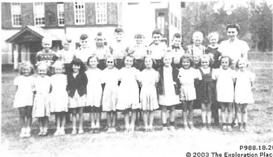
P988.18.20