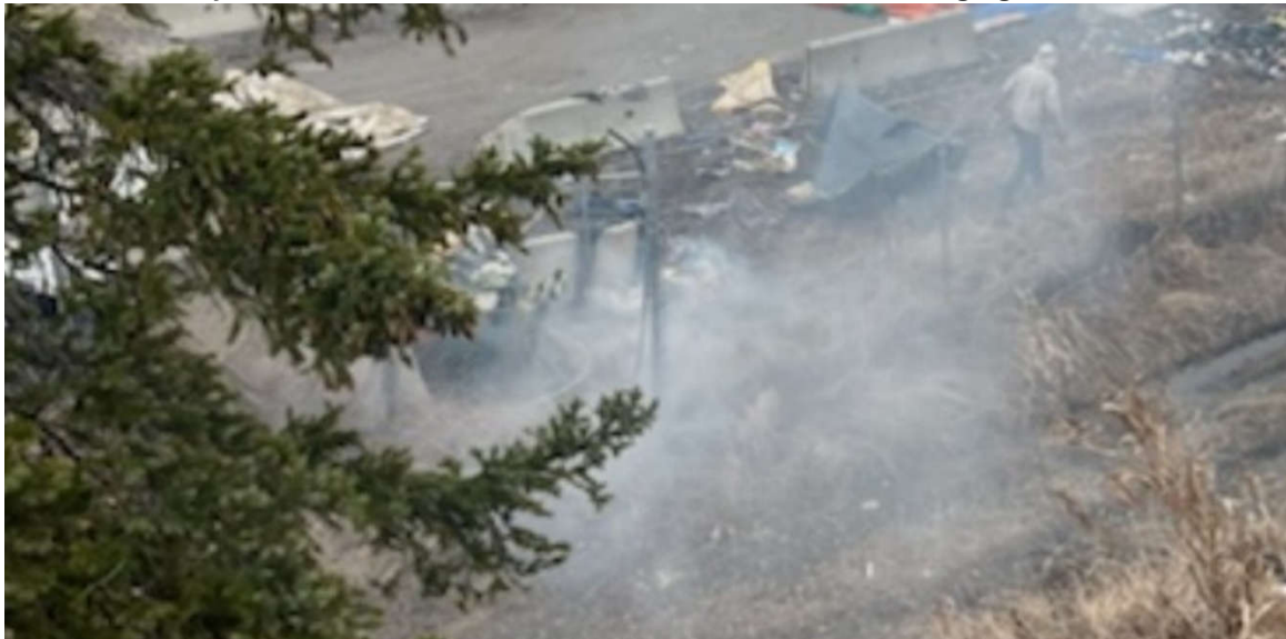
Lower Patricia encampment – March 27, 2024 – open burning smoke, typical