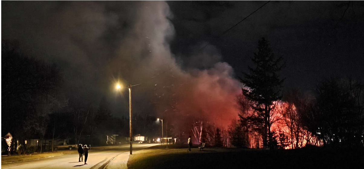
Structure fire – March 28, 2024 – Upper Patricia, embers landed on nearby houses/yards/trees

There have been numerous structure fires in the Lower Patricia encampment, both small and large, which not only lead to toxic air pollution in the PG Bowl and the Millar Addition neighborhood but also cause significant wildfire risk. The sloped embankment above the Lower Patricia encampment is forested and covered in dry brush. The large structure fire on March 28/24 caused the plume of black smoke to carry hot debris and sparks/embers up the embankment, across Upper Patricia Blvd, and onto cedar trees, yards and houses nearby.