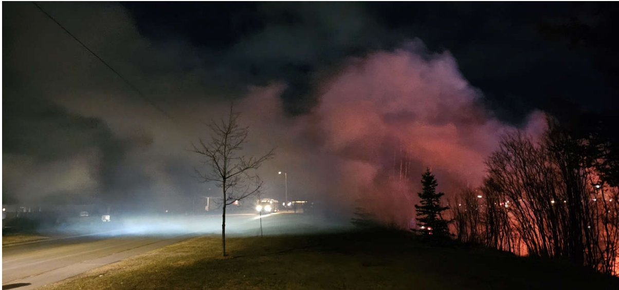
Structure fire – March 28, 2024 – Upper Patricia smoke blanketing neighborhood to the park