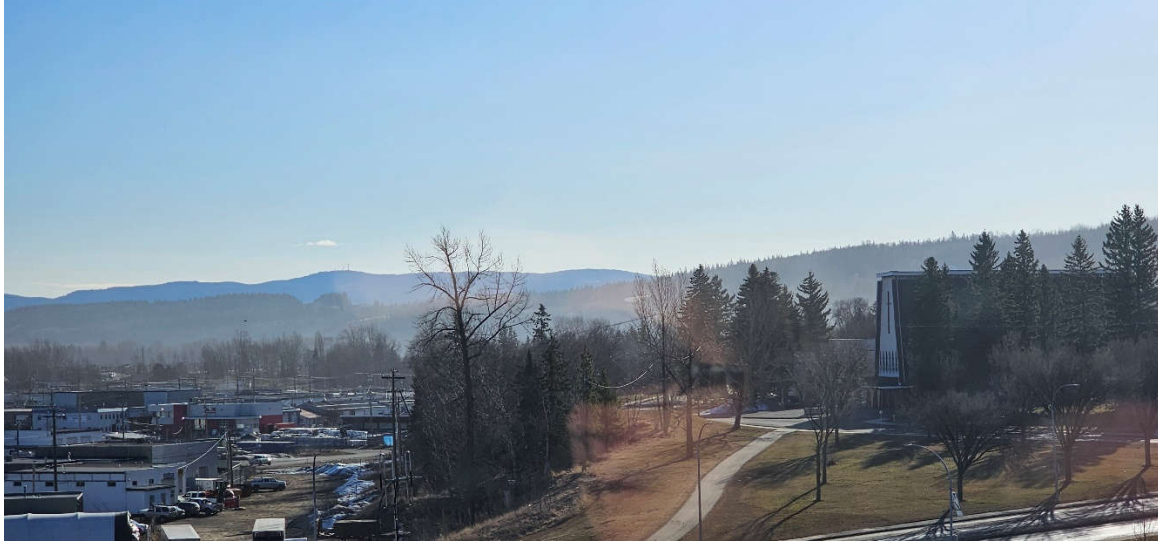
Taken from City Hall 5 th Floor – March 26, 2024 – notice smoke hanging over Millar Addition

The photos below are typical of what we see on a daily/weekly basis resulting from either regular burning or structure fires in the Lower Patricia encampment.