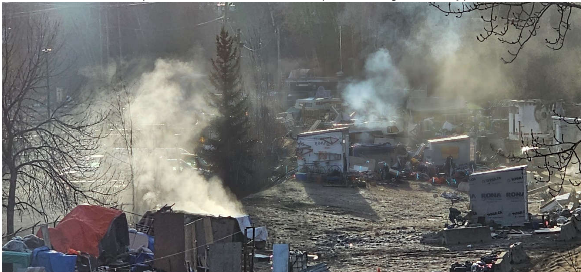
Lower Patricia encampment – April 10, 2024 – looks like this often in the mornings