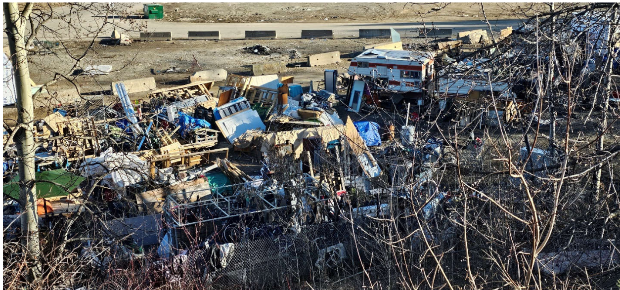
March 26, 2024 picture of small portion of the encampment living conditions

No person should have to live in the conditions currently being experienced in the Lower Patricia encampment - the trash, filth, human excrement, rats, mice, violence etc etc. There is no maximum security prison in all of North America I doubt, that would ask anyone to live in these conditions, and yet somehow the Province of BC expects this to be okay in Prince George.