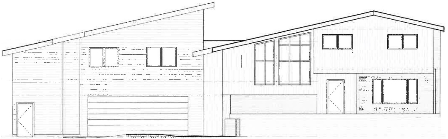
1 NORTHEAST ELEVATION SCALE: 1/4" = 1'-0"