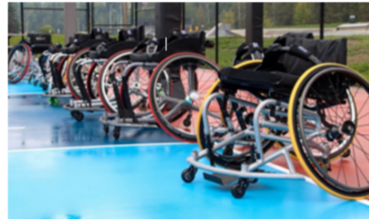
Figure 1. Shows a line of Wheelchairs at the Jumpstart Multi Sport Court in Carrie Jane Gray Park