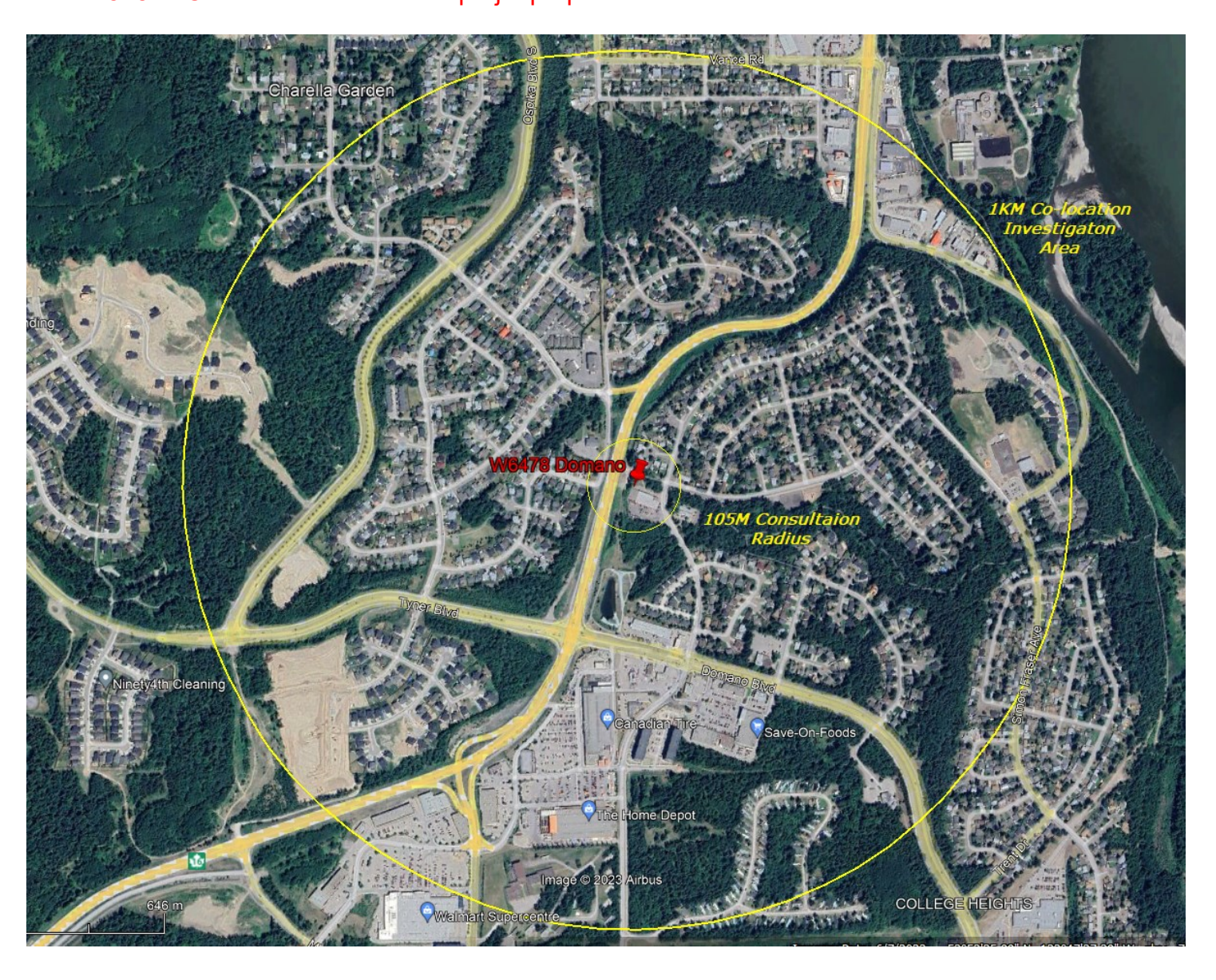
Appendix 1 : Location map of the Proposed Installation Annexe 1 : Carte de localisation du projet propose