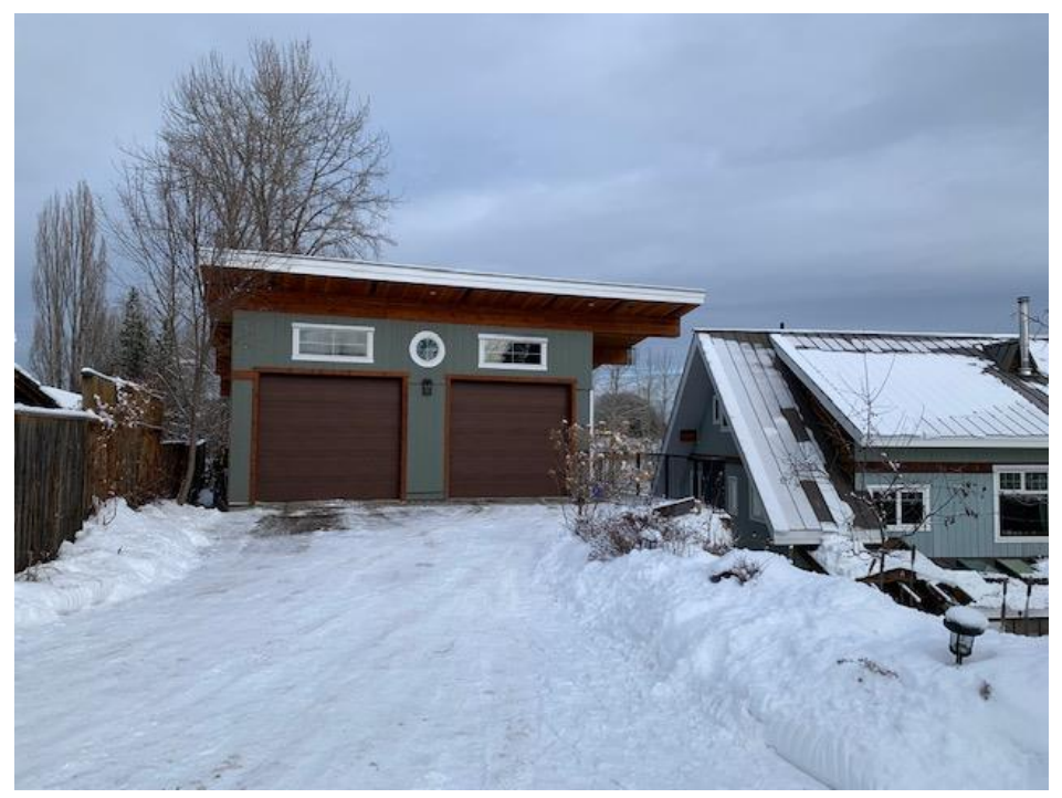
South side of garage – Neighbouring property is to the left of the fence line; main house on the right