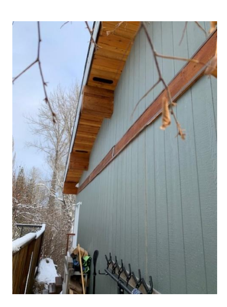
West Side – adjacent to neighbouring property; only garage portion is visible from adjacent property