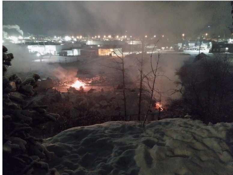
January 2, 2023