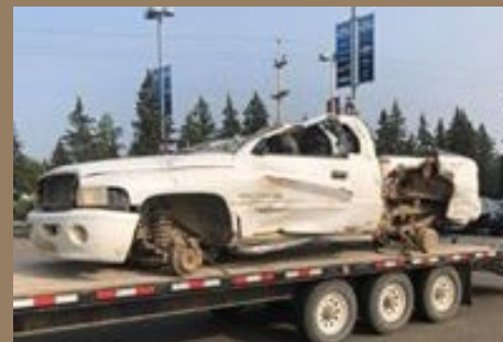
Back Country Clean Up