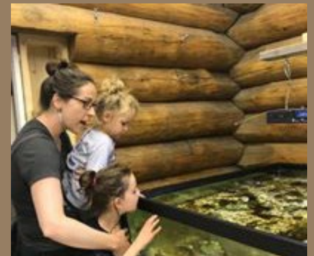
SCWA on site Salt Water Tanks