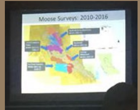
SCWA Hosted Speaker Forums