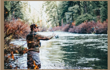
Back Country Fishing

In addition to the existing fish releases, SCWA will be hosting a Chinook release in the Nechako and coordinating another Chinook release, along with the Sturgeon release in Vanderhoof, creating truly regional partnerships.