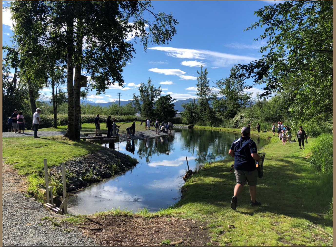
Learn to Fish Pond, Abbotsford BC

The pond facility will be seasonally operated and will be drawn down in the winter to reduce the risk of people or their pets falling through the ice during the non-operational season. SCWA is prepared to provide maintenance of the pond as part of the maintenance of the Hatchery.