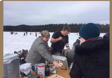
Family Winter Events