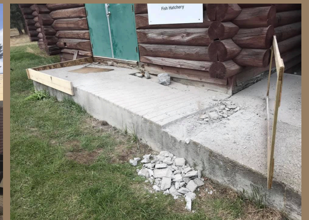
Wheelchair Ramp Repairs