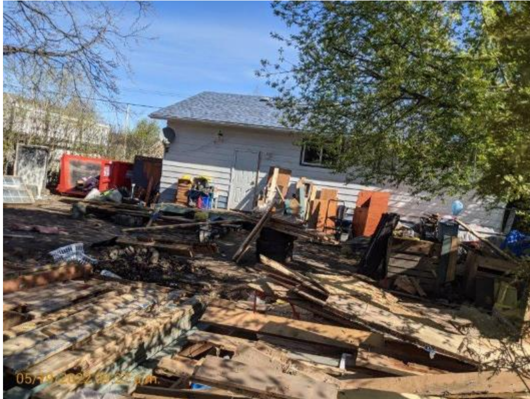
View of Back Yard with View of Residence