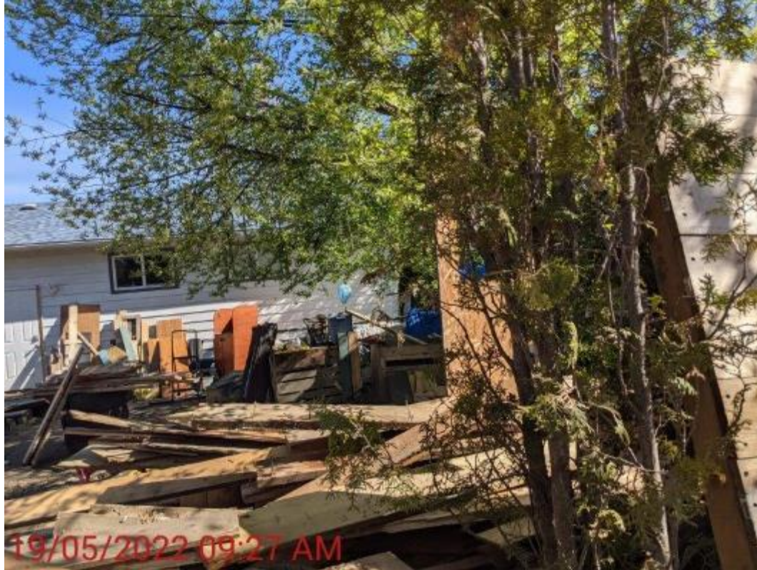
Inside Back Yard