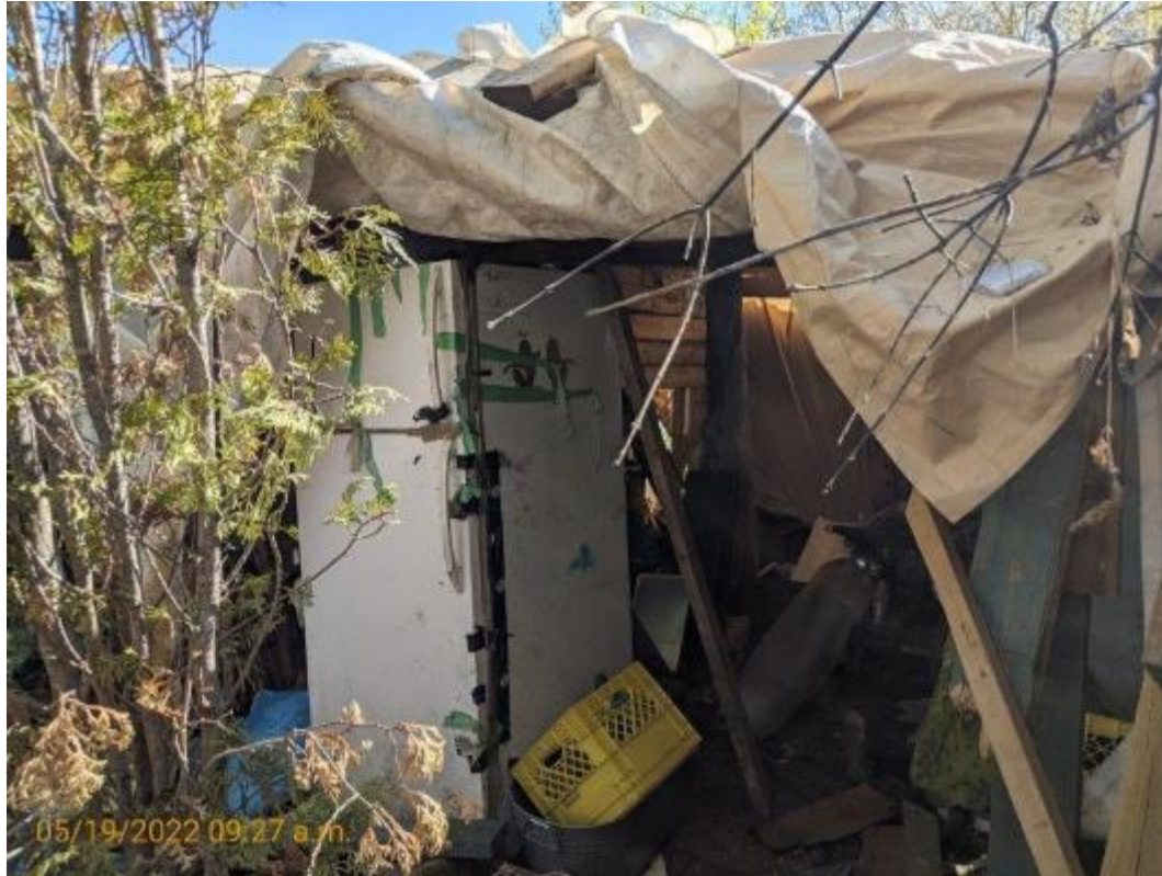
Temporary Structure in Back Yard