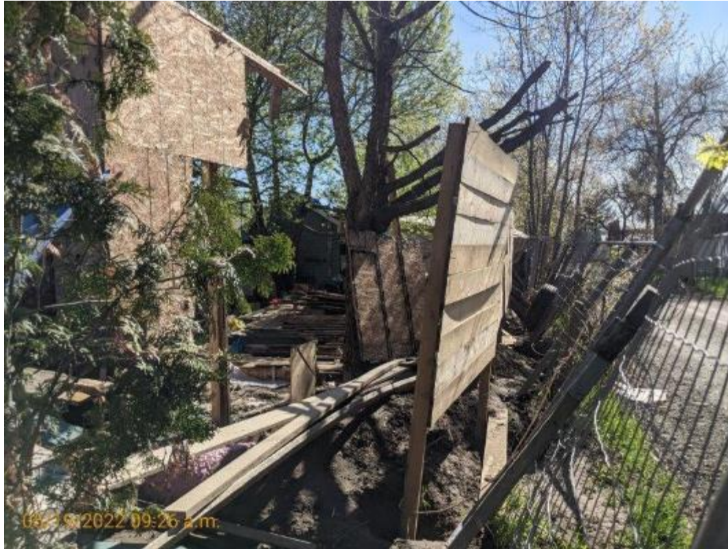
Inside Property Line Adjacent to Alley