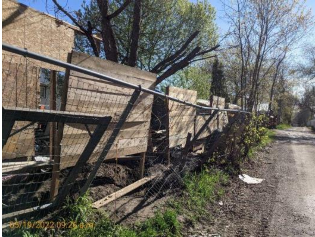
View From Back Alley