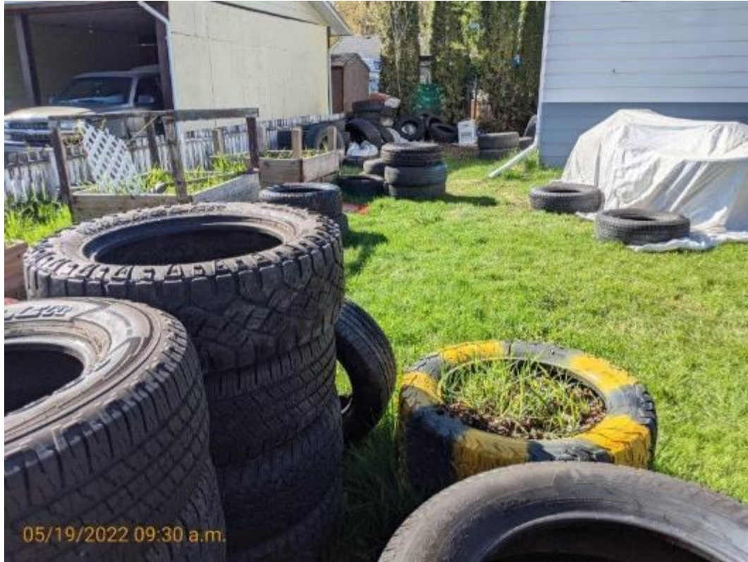
Inside Front Yard Fence