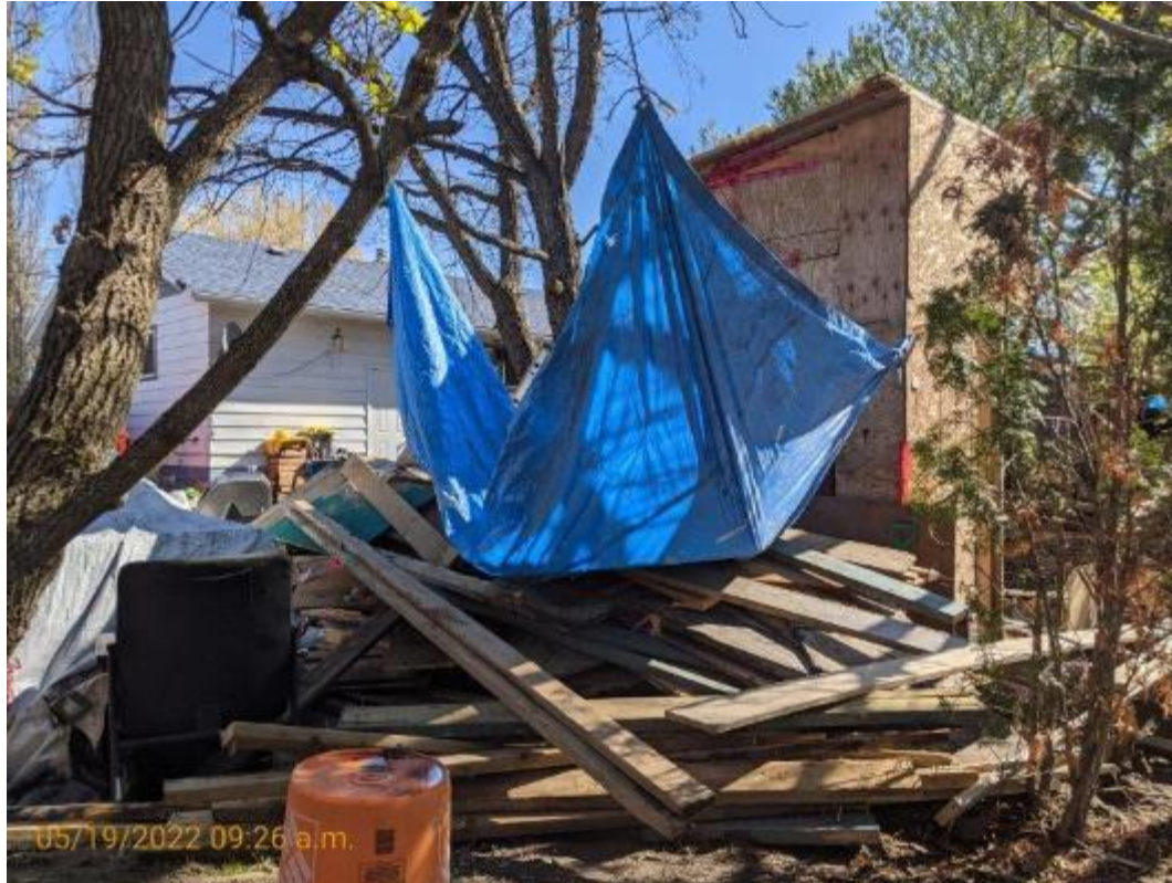
Inside Back Yard