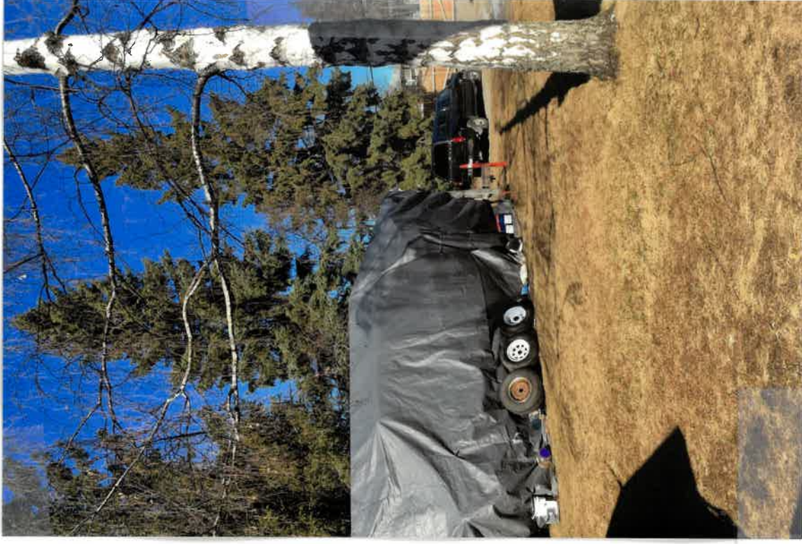
Photo of Backyard – Garage would be built where the boat is parked