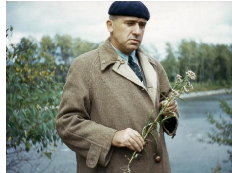
Above: Brother Marie-Victorin , the father of the Botanical Garden of Montreal.