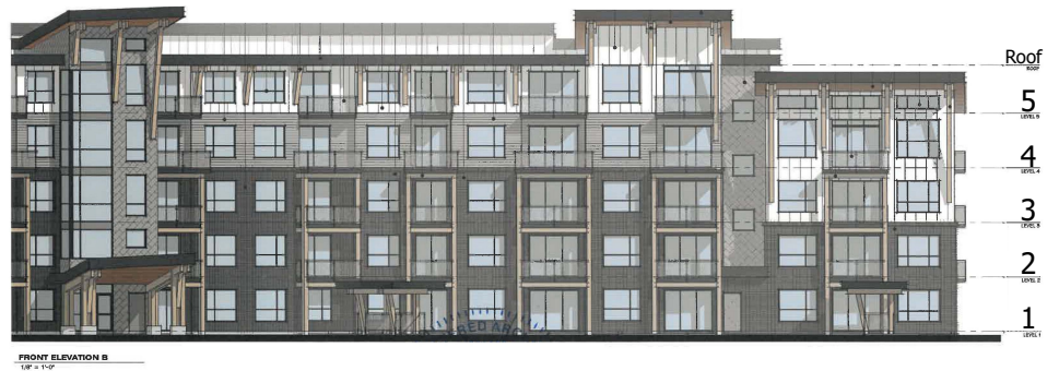
BUILDING B EXTERIOR ELEVATIONS