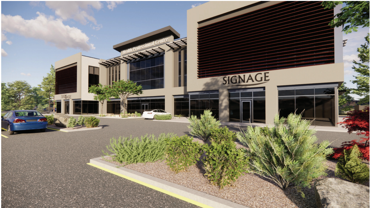
Prince George, British Columbia